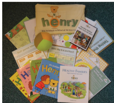
The HENRY Parent Toolkit - free to everyone joining a HENRY programme

The HENRY toolkit will help you give your child a great start in life, get the whole family involved, and keep track of how well you're doing.